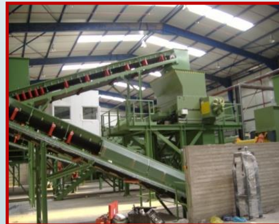
RDF treatment installation for energy recovery

Bianna Recycling SLU (Region Attica – Athens)