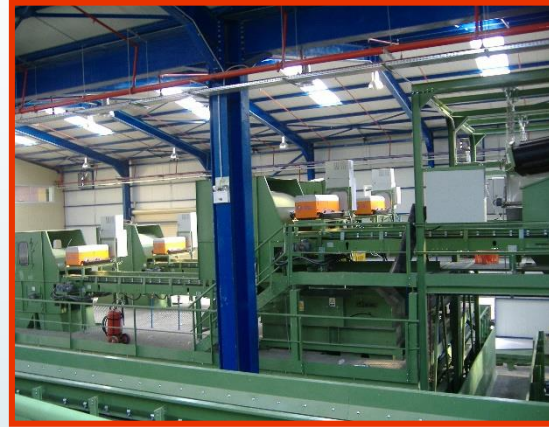
Automated sorting plant for Light Packing Waste

Bianna Recycling SLU (Region Attica – Athens)